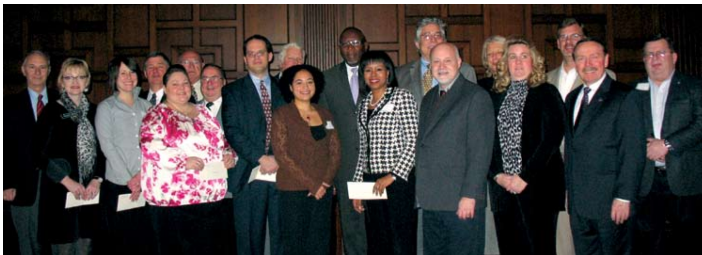
Our annual Community Day luncheon was hosted by the Scottish Rite of Indianapolis Foundation and held on January 21, 2010. Each year the Foundation distributes grants to community and Masonic organizations in support of their work.